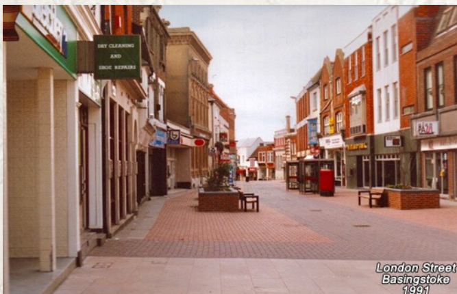
London Street Basingstoke 1991